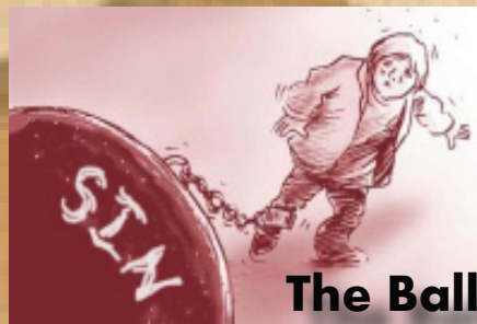
The Ball & Chain

Giz groaned, "All we need now is some mushy-cushy-lovie girl to ruin our adventure."