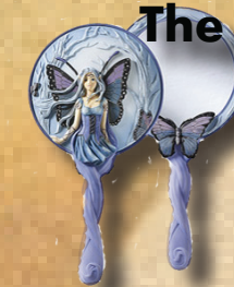
The Mirror of Vanity